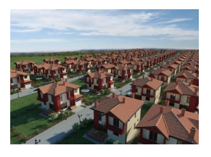
Fig.3 Mono-functional "NIC Residence"

As a result of the aforementioned chaotic expansions, the urban sprawl of Prishtina is different to other categories of urban sprawl. Further, it is rather difficult to differentiate a beginning and an end between the city and the expansion to suburban and rural areas. The urban unit of Prishtina itself, with its numerous expansions is fairly spread out, where parts of this expansion have almost merged with neighboring towns and villages; the international village adjacent to Ajvali, the NIC neighborhood in Cagllaviva or Marigona between Prishtina, Fushe-Kosova and Lipjan.